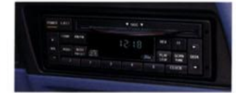
The outstanding quality of digital recording is reproduced through the Ford Compact Disc Player, available with the optional Ford JBL Audio System.