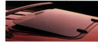
The optional tilt-up open air roof can be flipped open or removed. The optional roof rack (standard on Eddie Bauer) is also shown.

specific transportation requirements). Options available separately are also listed. Shown here are just a few of the many features that make Explorer a pleasure to own and drive. Some of them are included in select Preferred Equipment Packages.