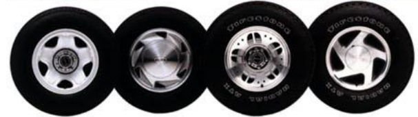
From left to right: styled steel wheel; full wheel cover; deep-dish cast aluminum wheel; and luxury cast aluminum wheel. See page 14 for application by trim level.