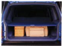
Among XLT standard features is a handy cargo cover.

There's excellent value, too, whether you choose the XL, XLT or Eddie Bauer. The superbly equipped XLT has standard items like power windows and door locks, speed control/tilt wheel and more. The luxurious Eddie Bauer adds outline-white-letter tires