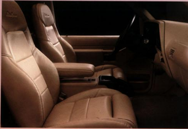
Left: Eddie Bauer sport buckets shown with optional leather seating surfaces. Garment and duffie bags are sent to you from Eddie Bauer.

The place to best enjoy it is, of course, out on the road. Driving this uniquely trimmed and superbly appointed sport utility is indeed a rewarding experience, one meant to be enjoyed by successful people of independent mind and adventurous spirit.