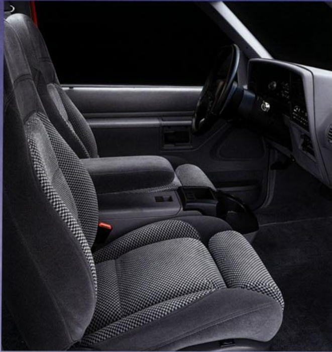
Above: Optional cloth sport bucket seats with console in Opal Grey.

Like all Explorers, the 2-Door Sport packs plenty of muscle. Under the hood are 4.0 liters of multi-port fuel-injected and computer-controlled V-6 power. A floor-mounted 5-speed manual overdrive is standard, or choose the electronic 4-speed automatic overdrive option with shift on the column.