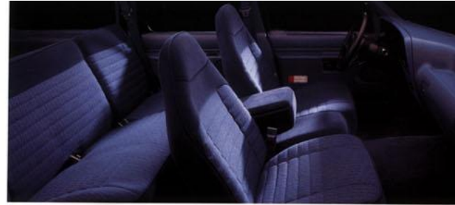
Left: Explorer XLT interior in Royal Blue with Preferred Equipment Package 941A and optional 3-passenger 60/40 split bench front seat.

Below: Explorer XLT 4-Door in Brilliant Blue Clearcoat Metallic. Preferred Equipment Package 941A includes air conditioning, electronic premium radio/cassette, and deluxe tape stripe.