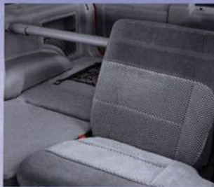
Right: A feature contributing to the Explorer 2-Door's versatility is the 50/50 rear split bench seat. Lower either one or both seat backs.