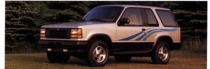
Part of the optional special appearance package, the sport tape stripe is available with XL and Sport 2-door models.